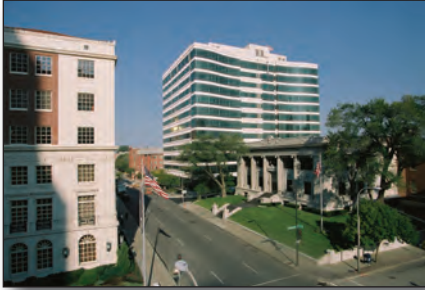
Americo's administrative offices in downtown Kansas City, MO

PO Box 410288 Kansas City, MO 64141-0288